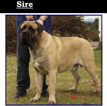
Am. Can. Int'l CH Stonebrook Walter, CGN, CGC TDInc, READ

For more information please contact us at \underline{temerson1215@wowway.com} \underline{www.stargazermastiffs.com}