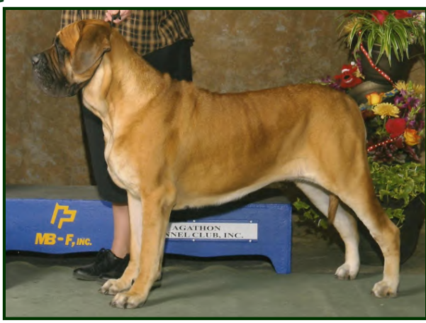
CH Devincourts Havin A Ball At Machree